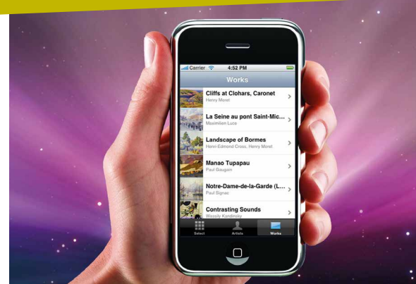
Custom mobile application development